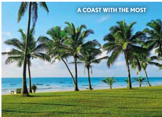
A COAST WITH THE MOST

Stay: Ol Malo – for exclusivity or total privacy, clients should head to this intimate lodge. Set on a rocky escarpment, it's family run and offers incredible hospitality and luxury in a magnificent setting.