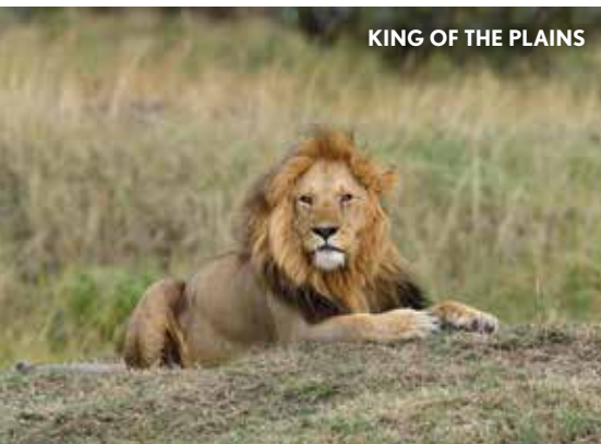
KING OF THE PLAINS